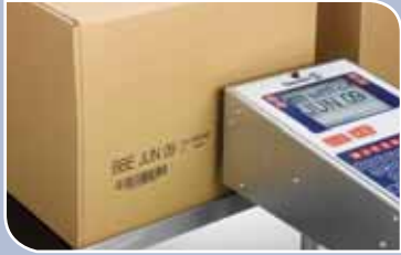
6000Plus with two print heads printing up to 34mm print height on a carton.