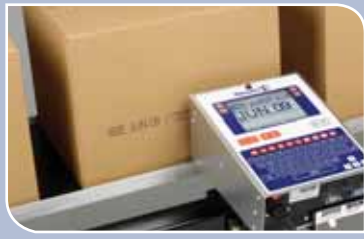
6000Plus printing onto a carton with 17mm text and graphics.