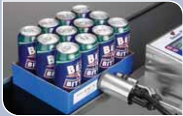
6000RPlus with optional remote print head for printing on to trays and in confined spaces.