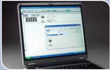
Optional Sauven message creation software for designing your unique messages off line and inputting alternative font styles and graphics.