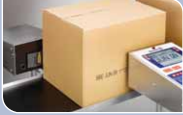
6000Plus printing on to both sides of a carton with an additional slave printer printing the same or different messages.